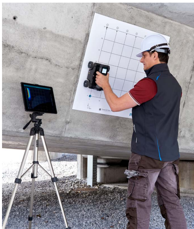
Proceq GPR Live performing an area scan with the aid of a Proceq grid paper