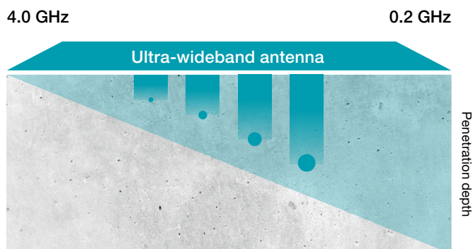
Proceq GPR Live covers all frequencies from 0.2 to 4.0 GHz with one single device. Lower frequencies allow deep penetration depths while higher frequencies allow for the detection of small objects.