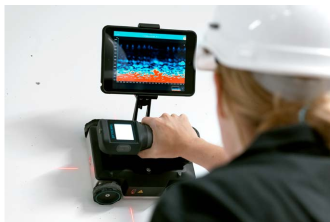
Proceq GPR Live combined with the device tablet holder

Proceq GPR Live is a groundbreaking product that offers a wide selection of accessories to fit every user's needs, such as the on-device tablet holder for single-hand operation and the telescopic rod for accessing hard-to-reach areas. Unlike other GPR products, its flexible set-up allows the user to always have a large screen at an optimal viewing position with all controls within easy reach.