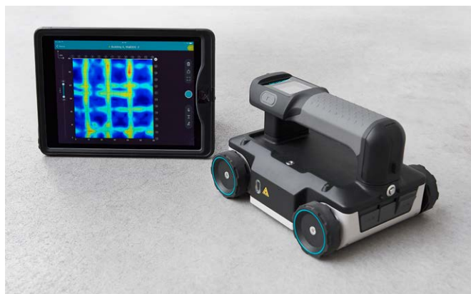
Proceq GPR Live scan car wirelessly connected to an iPad