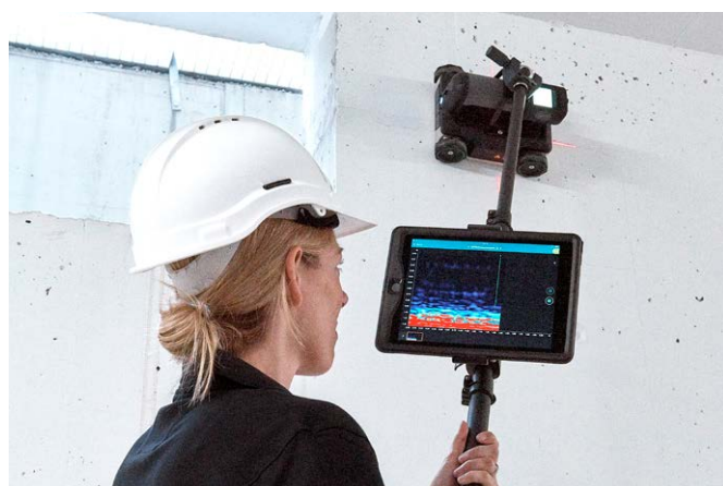
Proceq GPR Live combined with the telescopic rod with tablet holder

Proceq GPR Live is the beginning of a new era in NDT. The outstanding and unique ultra-wideband technology in structural building assessment combined with a compact wireless scan car delivers unmatched performance. The new Proceq GPR Live comes with the unique stepped-frequency continuous-wave (SFCW) technology delivering the widest frequency spectrum in the concrete assessment market. All applications typically addressed with multiple separate antennas in the range of 0.9 to 3.5 GHz can now be covered with a single device!